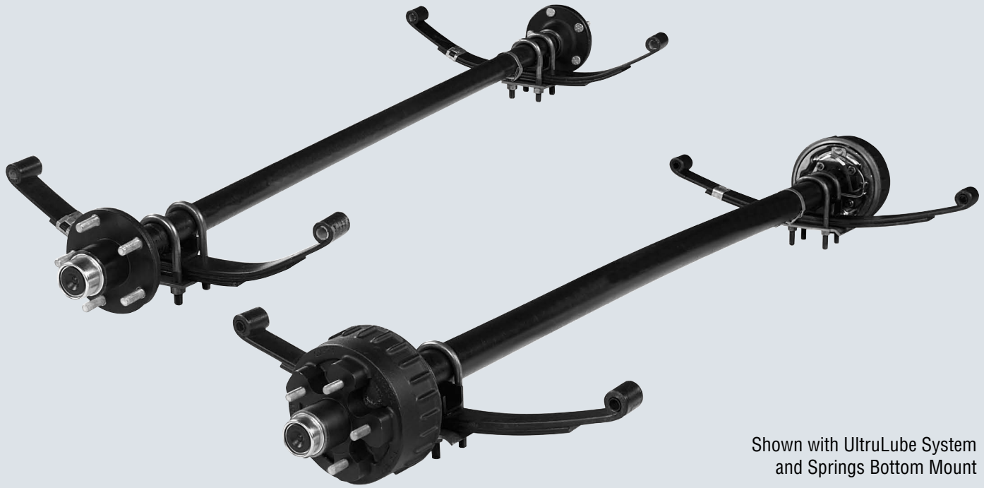
Shown with UltraLube System and Springs Bottom Mount

The T-20 is a round tube axle for light duty applications, available as a straight axle only. Popular applications are watercraft trailers, tent campers, utility trailers, golf cart trailers and motorcycle trailers.